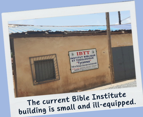
The current Bible Institute building is small and ill-equipped.

The Bible Institute of the EGCT: As soon as Phase 1 is finished, the Bible Institute will move to the new site under its new name, 'Institut Biblique Tyrannus' where it can start to build a Christian library. Evening classes will continue while the Institute gradually develops full-time courses that meet CITAF 1 standards so that it can offer accredited degree programs.