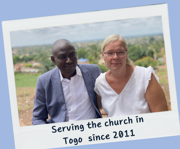
Serving the church in Togo since 2011