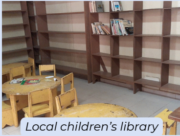
Local children's library