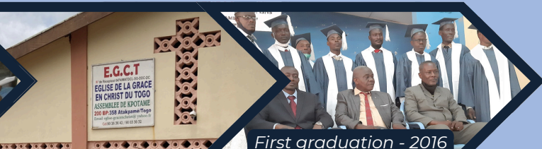
First graduation - 2016