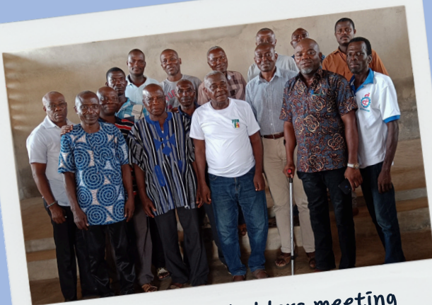
EGCT national elders meeting

God has blessed their efforts, and over the past 35 years, a small denomination of 10 congregations centred on the Word of God and salvation by free grace through faith in the Lord Jesus Christ has been established. Having adopted the 1689 London Baptist Confession of Faith, the EGCT churches are using these doctrinal outlines from the past to prevent error and safeguard clear Gospel preaching in the future.