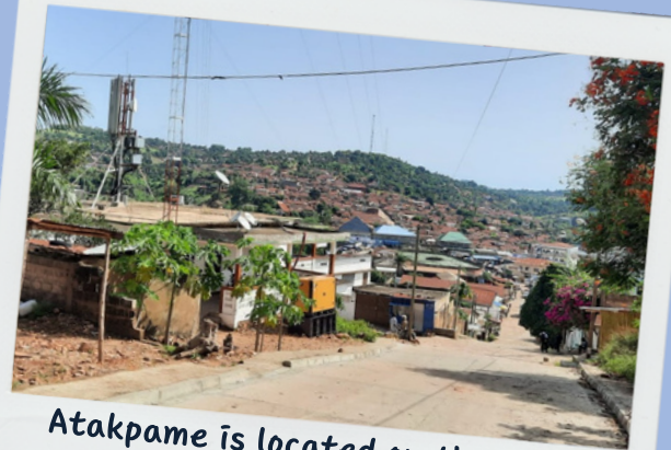
Atakpamé is located on the main north/south road in Togo.

The Beginning: In 1990 a group of young men in and around Atakpamé (a town 100 miles north of the capital Lomé) started reading sound theological books and by God's grace came to recognise doctrinal error being taught in their churches. They joined together to start a church that would clearly preach the Doctrines of Grace and " L'Eglise de la Grâce en Christ du Togo ," the Church of Grace in Christ of Togo, was born.