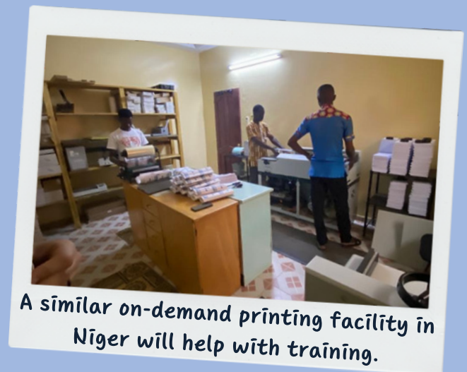
A similar on-demand printing facility in Niger will help with training.

PLEASE PRAY: For God's leading and provision during our fundraising journey for the printing press and the whole building process (Psalm 127:1)