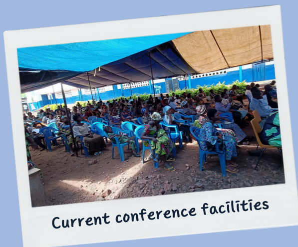
Current conference facilities

A Christian conference venue, 'Salle Tyrannus': Phase 1 will include a space that can function as a conference facility for the EGCT's own annual family conference. The well-equipped venue will also be a blessing for other churches to rent, providing revenue and widening the exposure of the Bible Institute, its Christian library, and the books being printed.