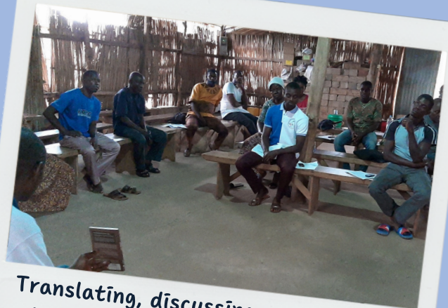
Translating, discussing, and applying a book together on Sunday afternoon

Growing Years: Whilst most of the bi-vocational elders have never had official theological training, they have all continued to study, read, and grow—many through the correspondence courses from Europresse: 'Echos de la Verité.' For 35 years they have faithfully preached the Gospel, led Wednesday evening Bible studies and Friday evening prayer meetings, pastored the members, conducted funerals and weddings, and visited the sick. With the first generation of EGCT elders ageing, the need for the next generation of church leaders to be trained became imperative.